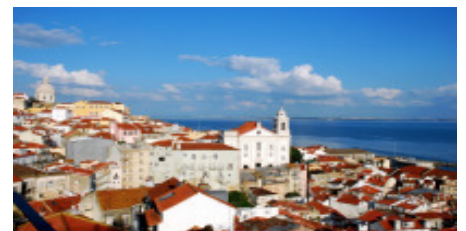
City of Lisbon

The training was offered in the format of a three day training period with presentations, discussions, case studies and workshops.