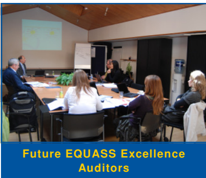
Future EQUASS Excellence Auditors

On 8 and 9 June 2009, EQUASS organised an EQUASS Excellence Auditor training. Participants from Portugal, Sweden, Norway and Ireland were trained in the method of scoring and auditing organisations on EQUASS Excellence criteria. They calibrated their individual performance and their results through a case study.