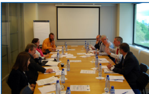
One of the discussion groups of the 2nd CEN workshop

The second meeting of the CEN Workshop 51 on Common Quality Framework (CQF) for Social Services of General Interest (SSGI) was held on 27 April 2009 in Brussels (Belgium).